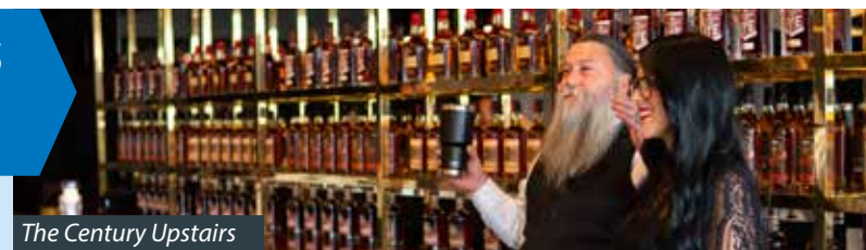
The Century Upstairs

$250M+ IN PROJECTS UNDER CONSTRUCTION OR IN THE PIPELINE IN THE CORE OF DOWNTOWN DAYTON