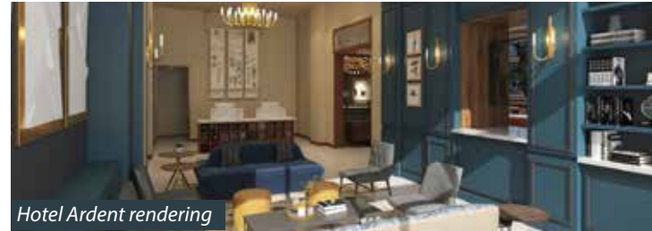
Hotel Ardent rendering

Construction continued on the Hotel Ardent project on Main Street. The hotel is expected to open in the fourth quarter of this year or the first quarter of 2023.