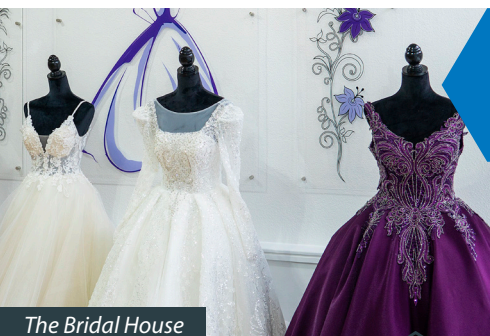
The Bridal House

The spring class of 2022 began its first Retail Lab sessions. This cohort includes six minority-owned businesses and six women-owned businesses. Overall, the Retail Lab counts 37 businesses among its current cohort and recent graduates. 34 of those businesses are minority-owned and/or women-owned. The next class will take place in the fall; applications are set to open in the third quarter.